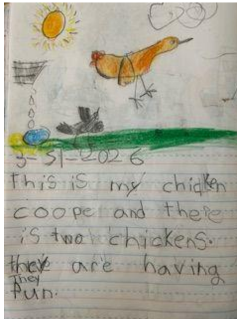
Josie B. - Primary Blue