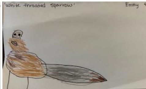
Emmy - Preschool