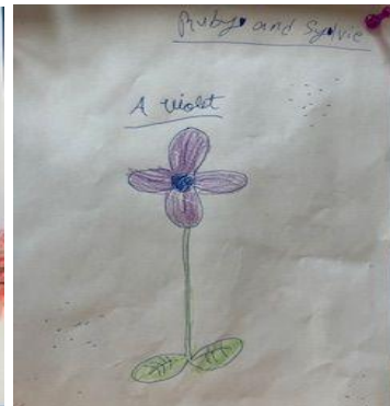
Ruby&Sylvie - SRS/PB