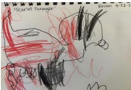
Vivan - Preschool