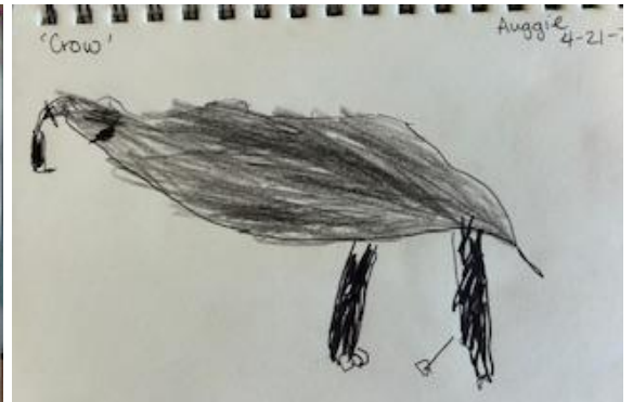
Auggie - Preschool