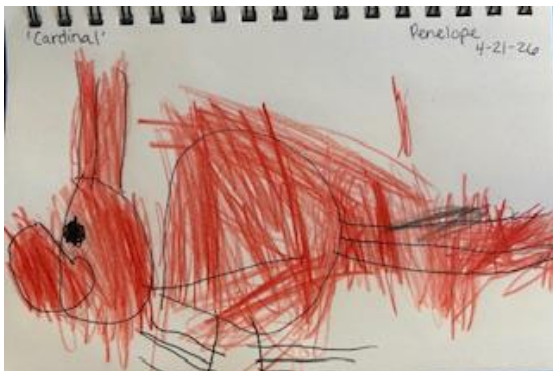
Penelope - Preschool