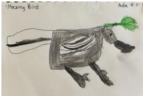
Ada - Preschool