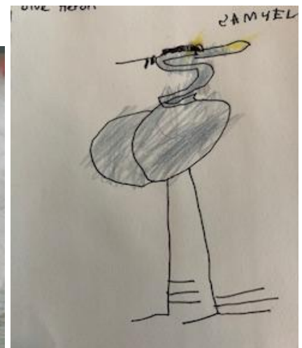
Sammy - Preschool