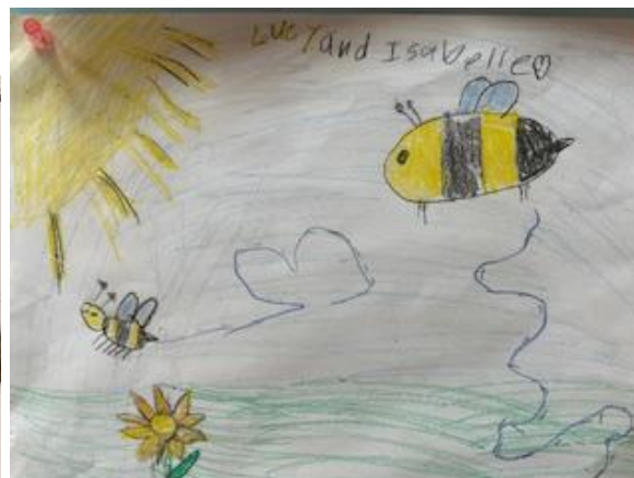
Isabelle & Lucy - Primary Yellow & Seniors