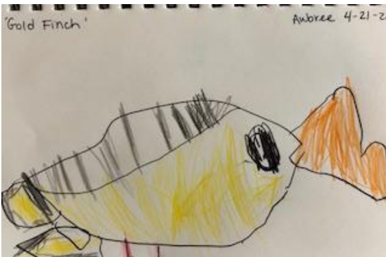
Aubree - Preschool