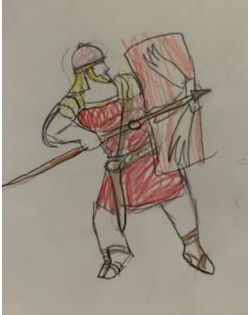
Eleanor - Seniors