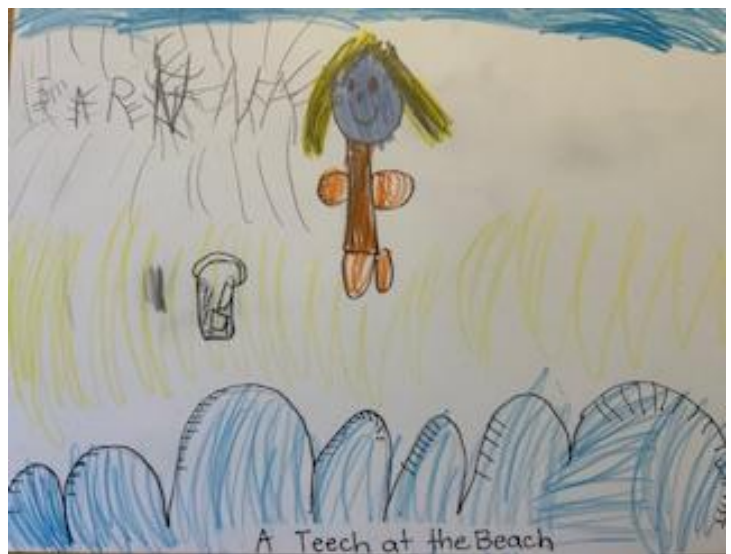
Karena - Early Primary