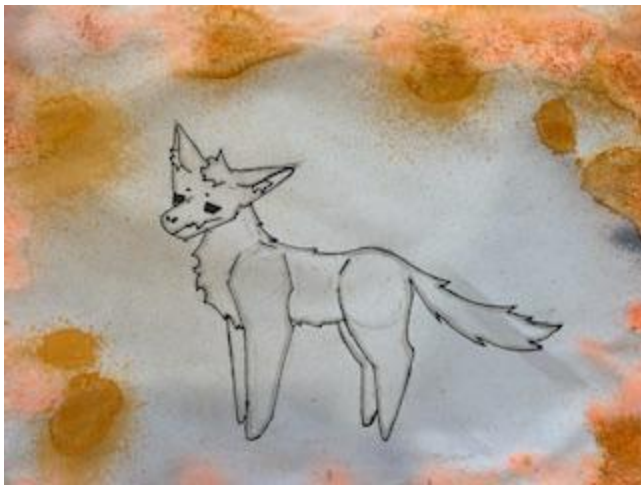
Abalene - Middle School