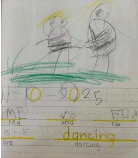
Cora Luna - Early Primary