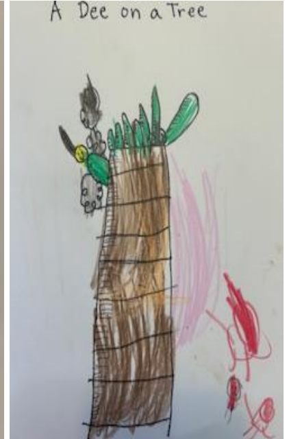
Levon - Early Primary