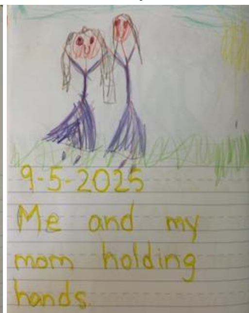
Dalilah - Early Primary