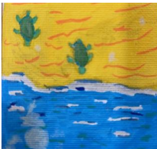
Carolina - Seniors