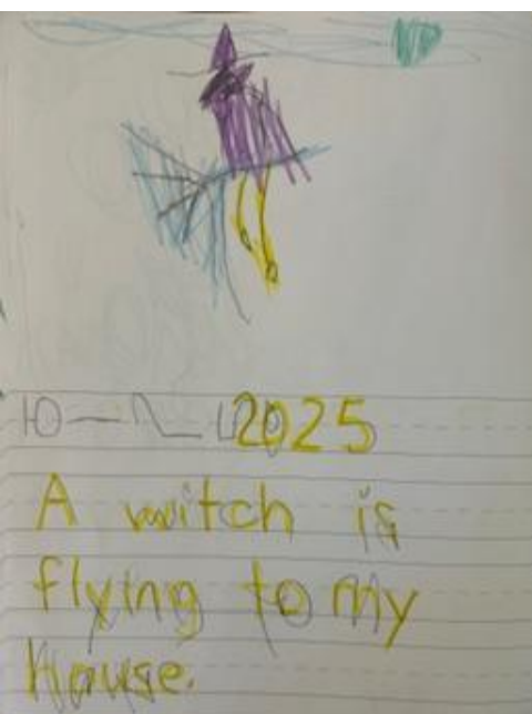
Karena - Early Primary