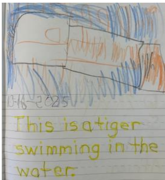
Levon - Early Primary