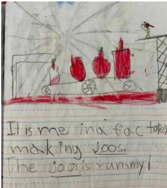
Kellan - Primary Yellow