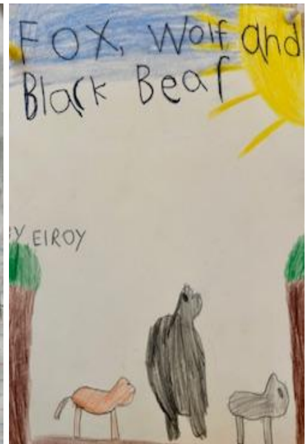
Elroy - Juniors