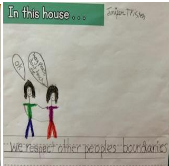
Juniper & Tristen - Juniors