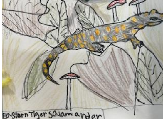
Alice - Juniors