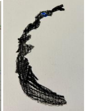
Hayes - Preschool