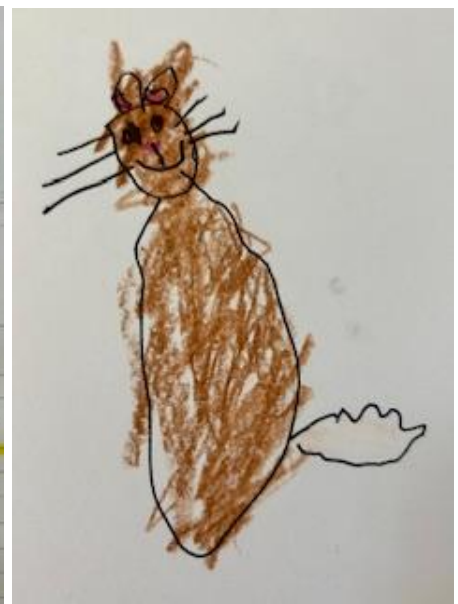
Boston - Preschool