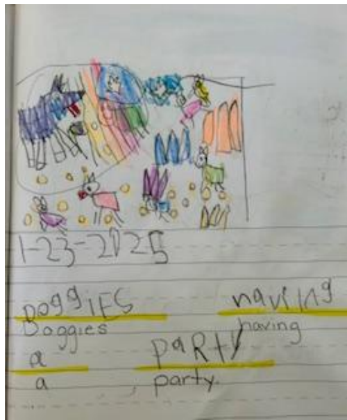
Eva Raine - Early Primary