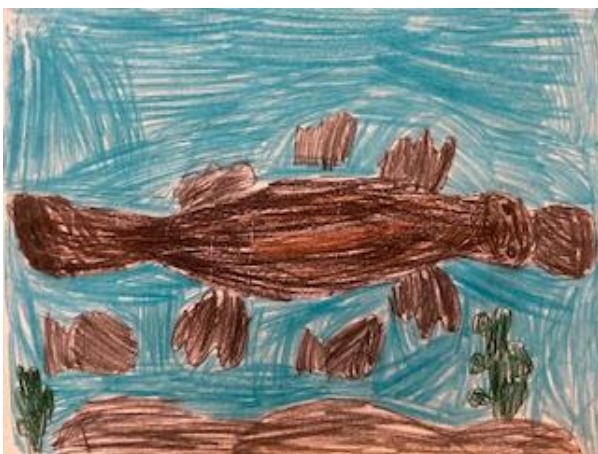
Aiden - Juniors