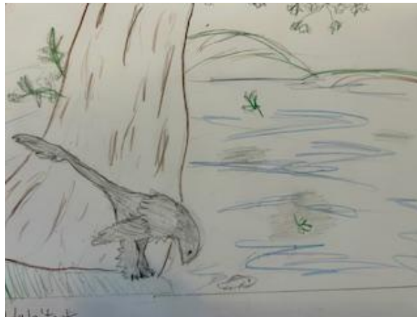
Abalene - Seniors