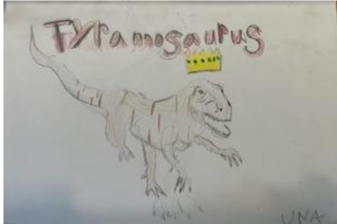
Una - Seniors