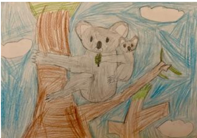
Ruby - Juniors