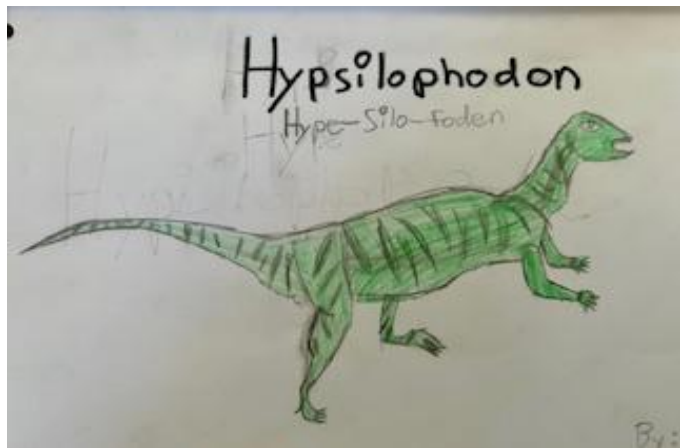
River - Seniors