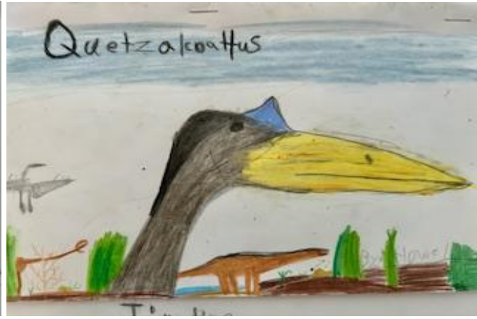
Howel - Seniors