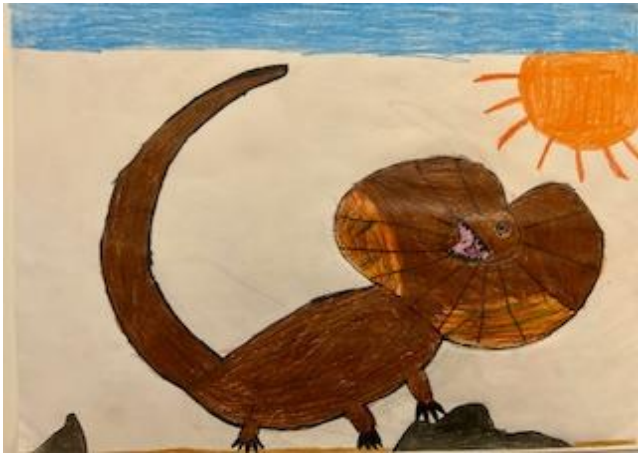
Maxwell - Juniors