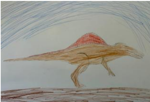
Laxman - Seniors