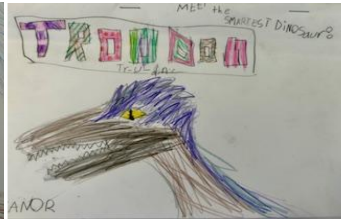
Eleanor - Seniors