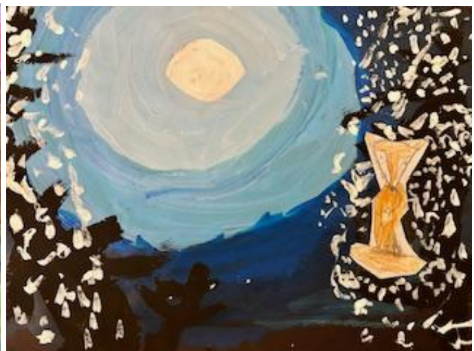
Hyde - Primary Yellow