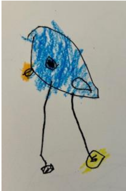
Levon - Preschool