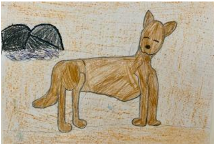
Junie - Juniors