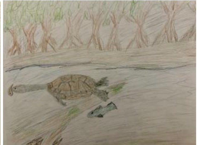
Rowan - Juniors