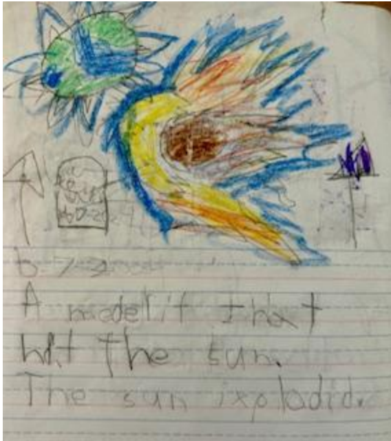
Kellan - Primary Blue