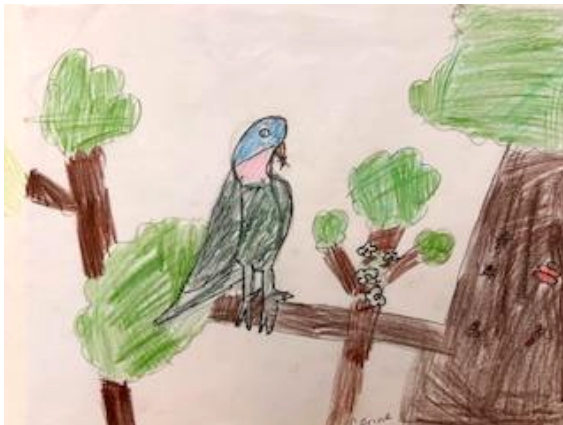
Carina - Juniors