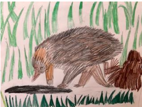
Eleanora - Juniors