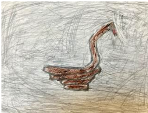
Wes - Juniors