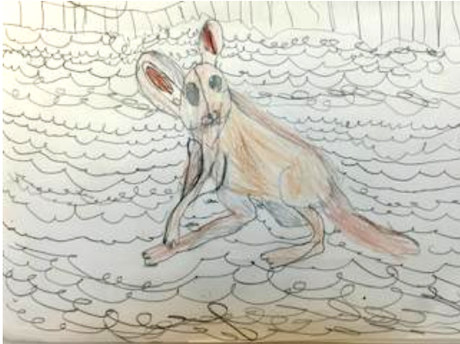
Oscar - Juniors