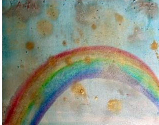
Aria - Seniors