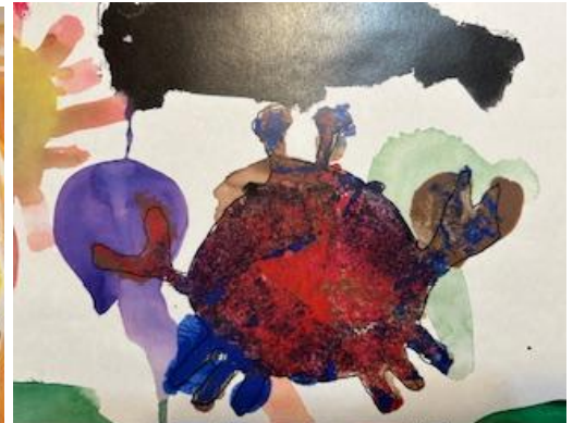
Holden - Preschool