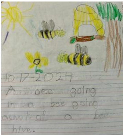
Indie - Primary Blue