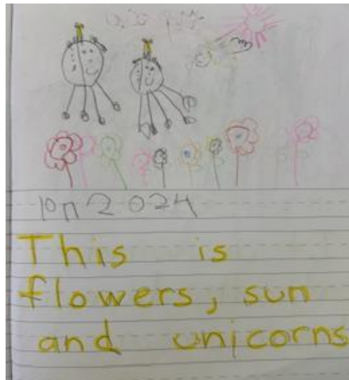
Holly - Early Primary