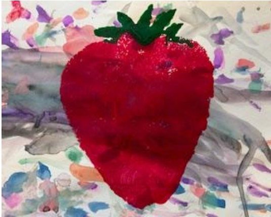
Penelope - Preschool