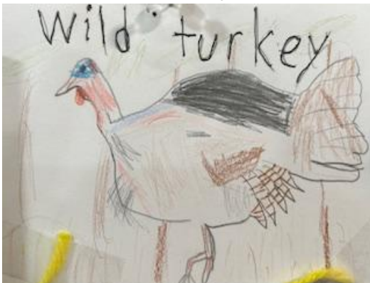
Ollie - Juniors