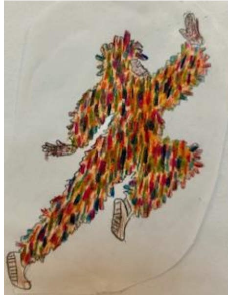
Freya - Juniors