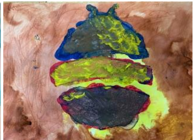
Aubree - Preschool