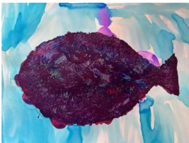
Hayes - Preschool