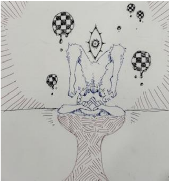
Wren - Middle School