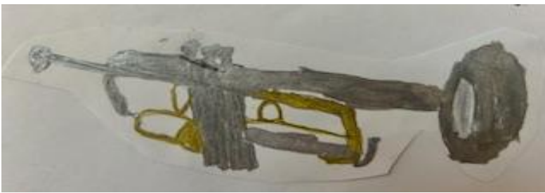
Eamon - Juniors