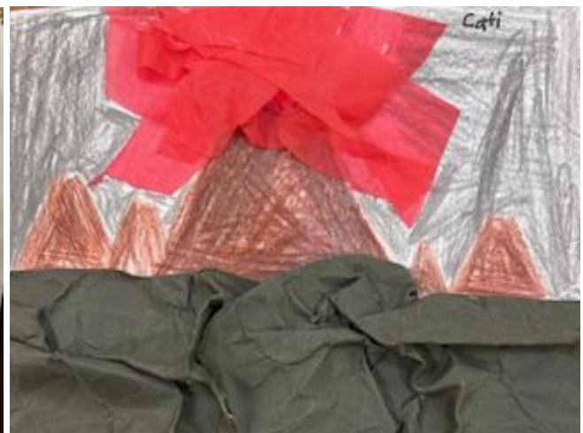
Cataleya - Seniors