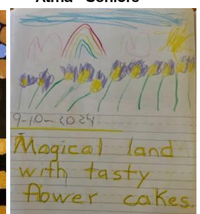
Stone - Early Primary