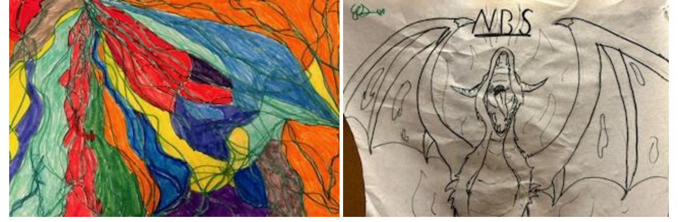
Owen - Primary Yellow