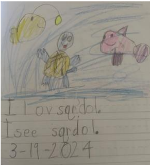
Maya - Early Primary