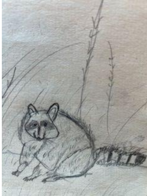
Oliver - Juniors