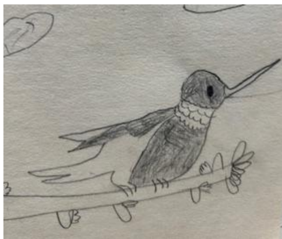
Ruby - Juniors