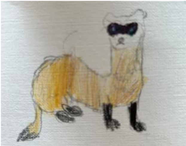
Una - Juniors