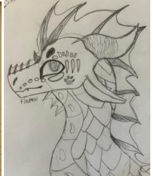
Essa - Seniors