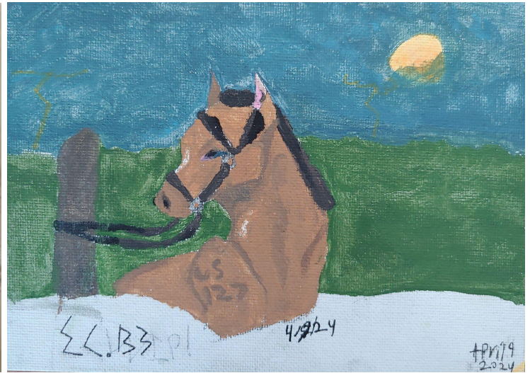
Cory - Seniors