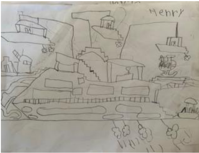
Henry - Primary Yellow