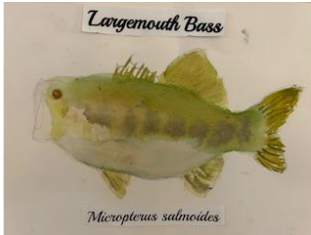
Althea - Seniors