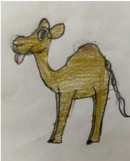
Annabelle - Seniors