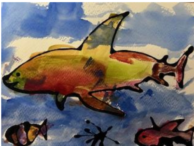
Rowan - Preschool