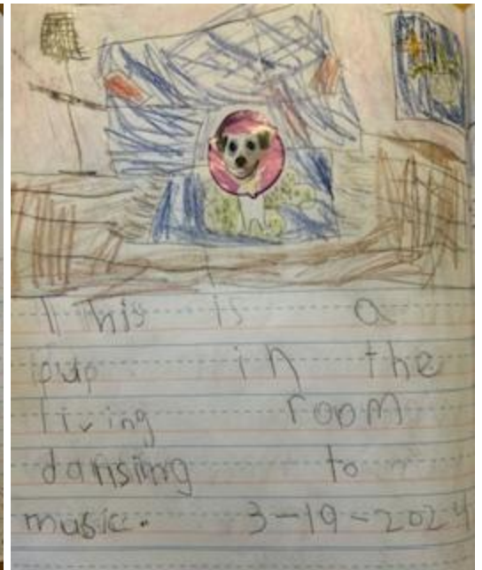
Betty June - Primary Blue