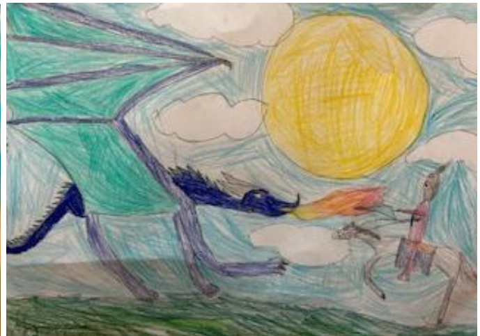
Cypress - Seniors