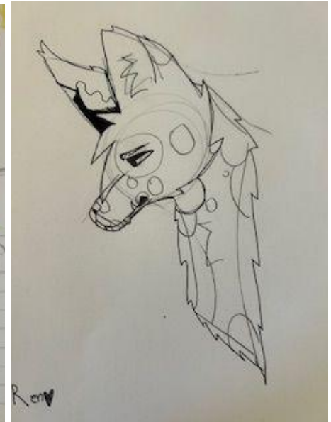
Cory - Seniors