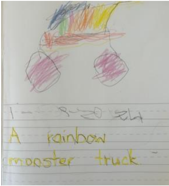
Elijah - Early Primary