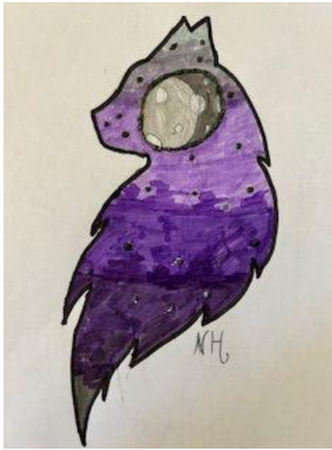
Natalia - Seniors