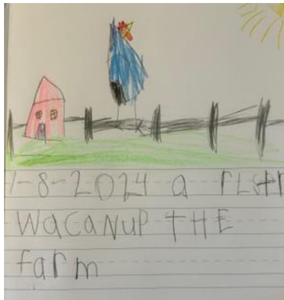
Maya - Early Primary