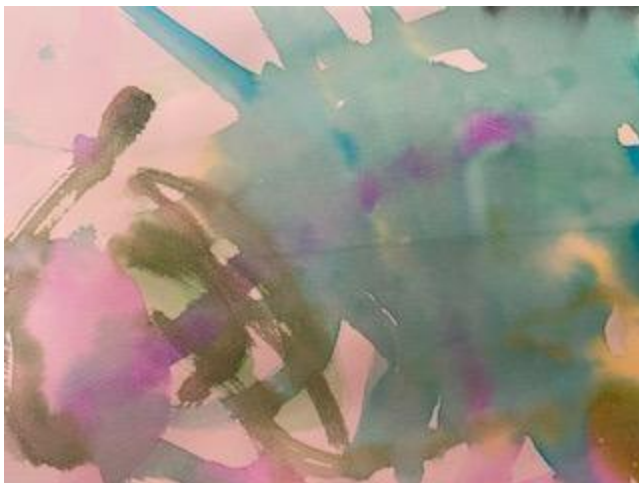
Cora Luna - Preschool