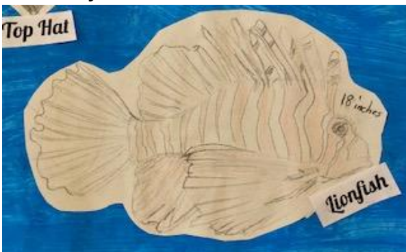
Indigo - Middle School