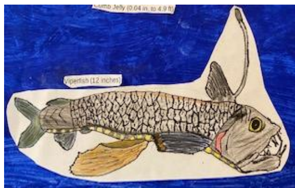
Piper - Middle School