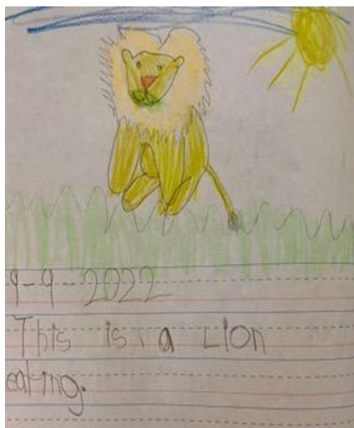
Eva- Primary Blue