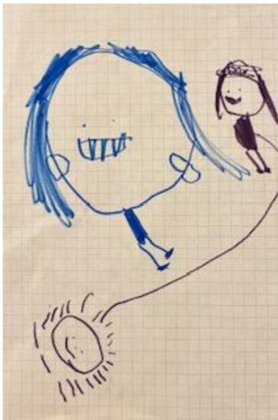
Ellie - Preschool

https://north-branch-school.org/fundraising/donate-your-car-to-benefit-nbs/