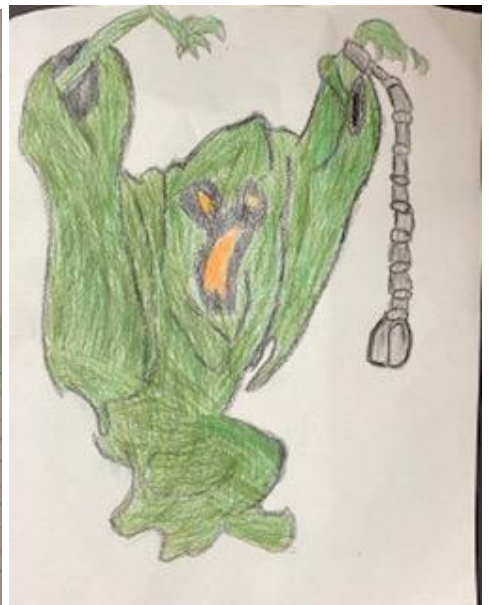
Maxwell - Primary Yellow